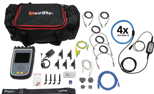
MPQ1000 Silver Plus Kit C/N MPQ1000-S-KIT-PLUS

Includes MPQ1000 analyzer, voltage leads, SD card, USB cable, ethernet cable, universal power adapter, soft-sided carry bag, plus hanging strap, voltage lead plunger clips, and 4 MCCV6000-27 (four range flex 27 cm ID) CTs