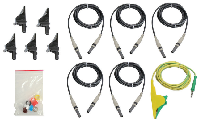
MPQ1000 Voltage Lead Set (2007-259)