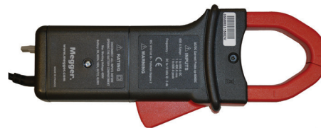
Hall Effect Current Clamp 600 A dc and 400 A ac (CP-600DC-ID)