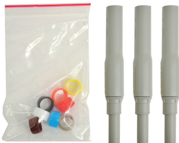
Optional Fuse Adapter Kit (1008-645)

Includes 4 adapters with multiple color straps.