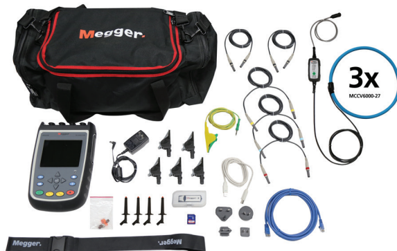
MPQ1000 Gold Kit C/N MPQ1000-G-KIT

Includes MPQ1000 analyzer, voltage leads, SD card, USB cable, ethernet cable, universal power adapter, soft-sided carry bag plus fuse adapters and hanging strap. Does not include current clamps.