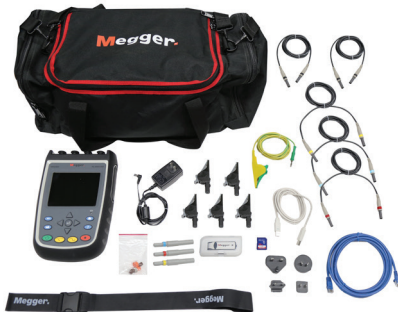
MPQ1000 Basic Kit C/N MPQ1000-BASIC

Includes MPQ1000 analyzer, voltage leads, SD card, USB cable, ethernet cable, universal power adapter, soft-sided carry bag plus fuse adapters and hanging strap. Does not include current clamps.