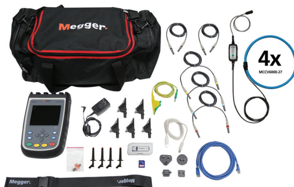
MPQ1000 Gold Plus Kit C/N MPQ1000-G-KIT-PLUS

Includes MPQ1000 analyzer, voltage leads, SD card, USB cable, ethernet cable, universal power adapter, soft-sided carry bag, plus hanging strap, voltage lead plunger clips, and 3 MCCV6000-18 (four range flex 18 cm ID) CTs