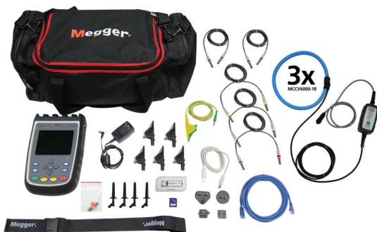
MPQ1000 Silver Kit C/N MPQ1000-S-KIT

Includes MPQ1000 analyzer, voltage leads, SD card, USB cable, ethernet cable, universal power adapter, soft-sided carry bag, plus hanging strap, voltage lead plunger clips, and 3 MCCV6000-27 (four range flex 27 cm ID) CTs