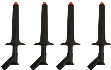
Optional Plunger Clips (1008-756)